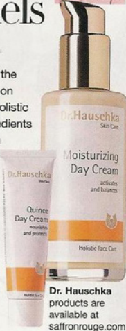
Dr. Hauschka products are available at saffronrouge.com