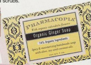
Pharmacopia Organic Ginger Soap ($11, above); Doux Me Eye Contour Cream ($85, right)