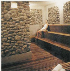
SHAKEN AND SPARKLY The $10,000 cocktail (above) and the Great Jones Spa (left)

waterfall and holistic principles. Those arriving with time to spare before such treatments as the five-step Sento treatment ($230) or colonic hydrotherapy ($140) may partake in the hot tubs, plunge pools and a 30-person river rock sauna. In the latter, one can also receive the signature River Rock Plaza treatment (described as a mild lashing with eucalyptus or oak branches). Great Jones also offers a 6- to 12-week detox program, complete with counseling. Stars have been spotted coming and going from the spa, yet they seem to disappear once inside. You can thank the VIP elevator that leads to private locker and treatment rooms for that.